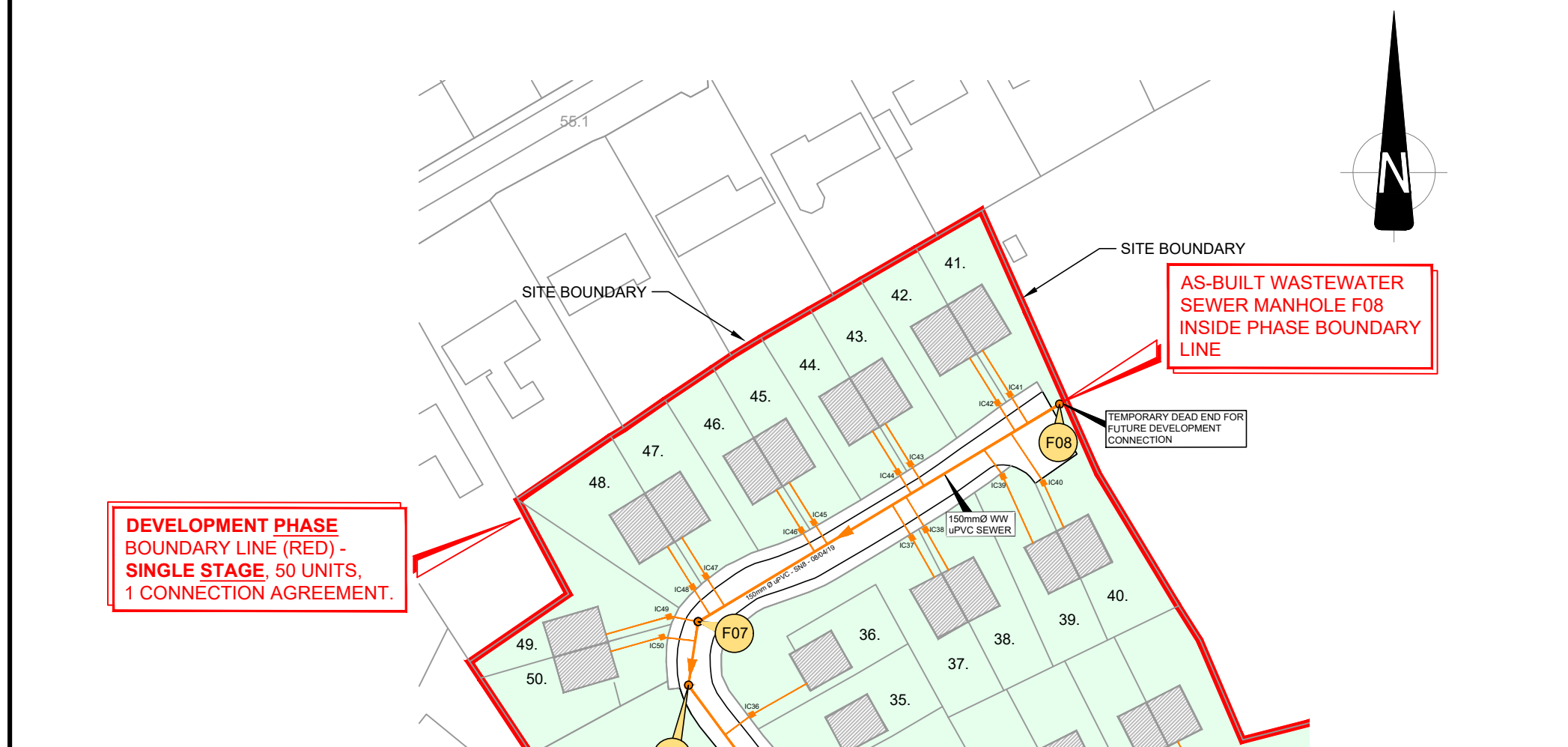
1:1000 DETAIL 1: INFRASTRUCTURE WITHIN A DEVELOPMENT PHASE BOUNDARY