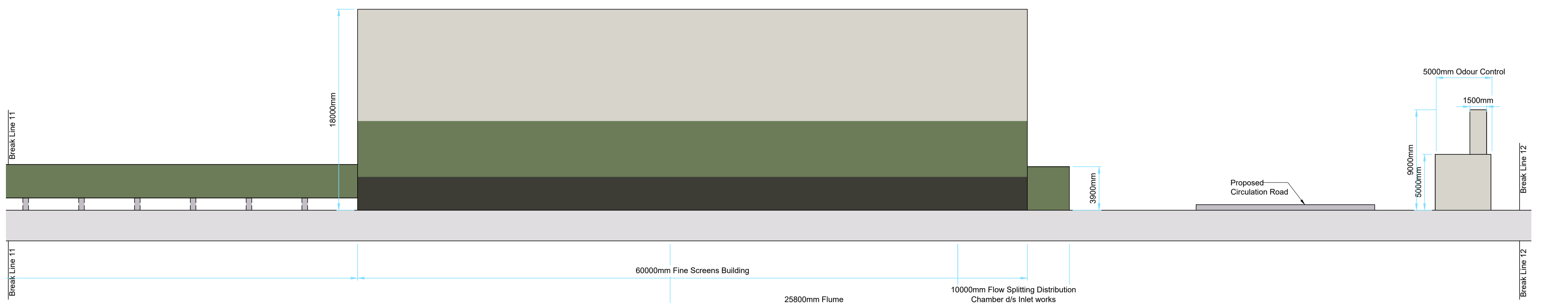
Sectional Elevation Looking North - Elevation 3 Scale 1:200